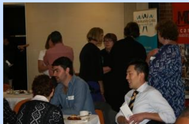
Our wonderful Community Service and GP Supervisor colleagues had the opportunity to share their networks and a meal