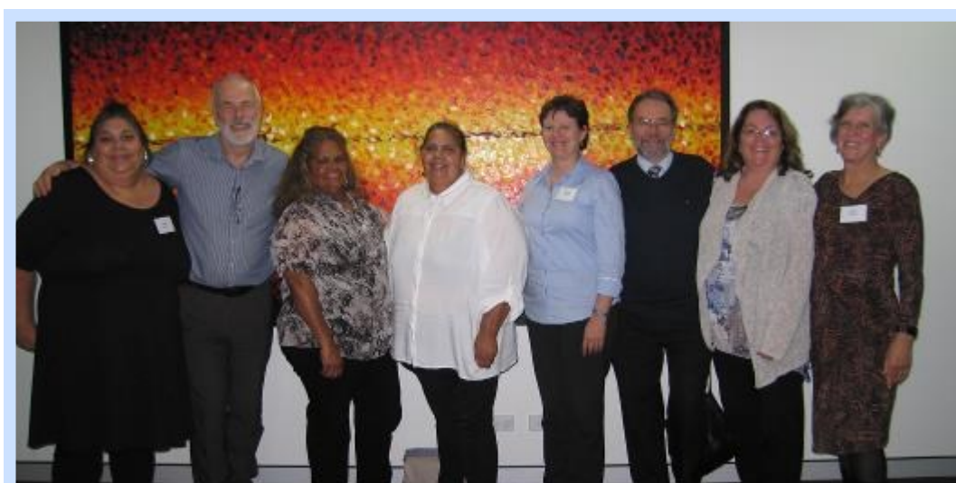
AMS Western Sydney Chronic Care Team