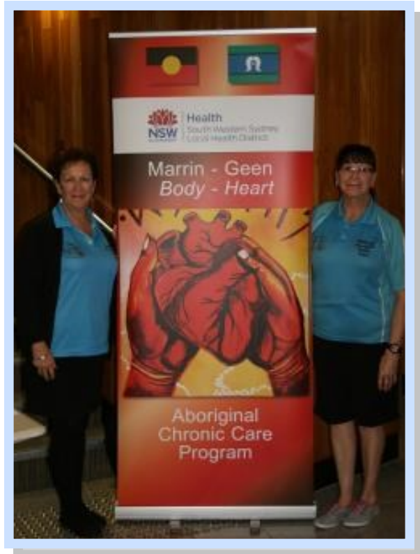
Miller Community Health - Aboriginal Chronic Care program