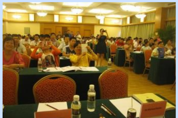
A very engaged and captive audience taking photos of the presenters

They also contributed to a 3-day “Training of Trainers” workshop, which is a key component of implementing a new GP system as China has relatively few trained GPs at present.