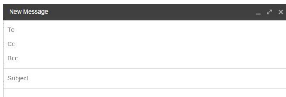
Figure 1. Sending a message using Gmail.

Including someone in the Bcc field sends them a copy of the message, but the person in the To: field won't know that the message has been copied to anyone. The Bcc field can be useful if you want to send a message to a lot of people but you don't have permission to share everyone's email addresses. Think carefully before using the Bcc field for any other reason, as it's kind of sneaky to send someone an email without other recipients knowing that that person was also included.