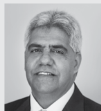
Mr Paul Newman