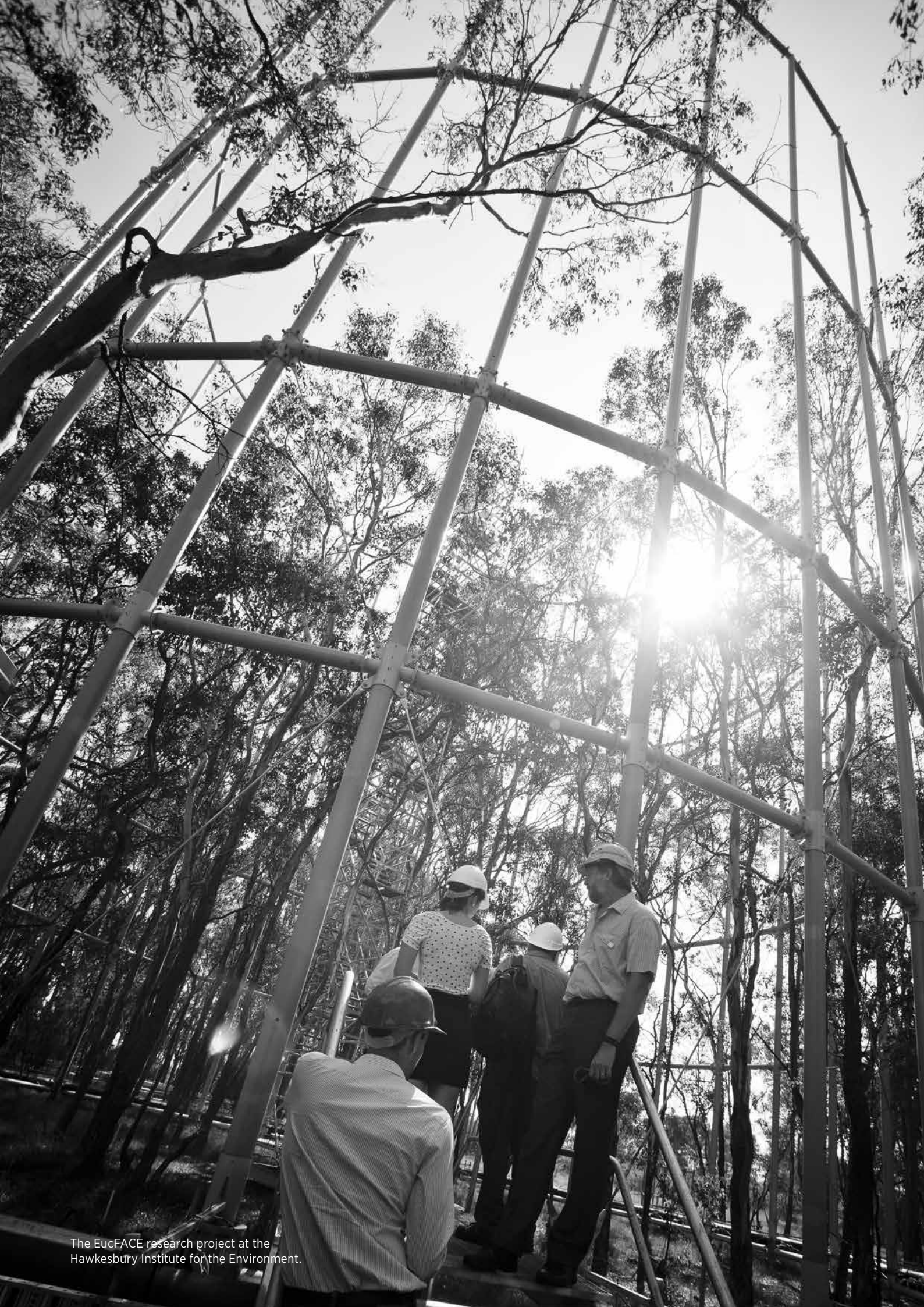
The EucFACE research project at the Hawkesbury Institute for the Environment.