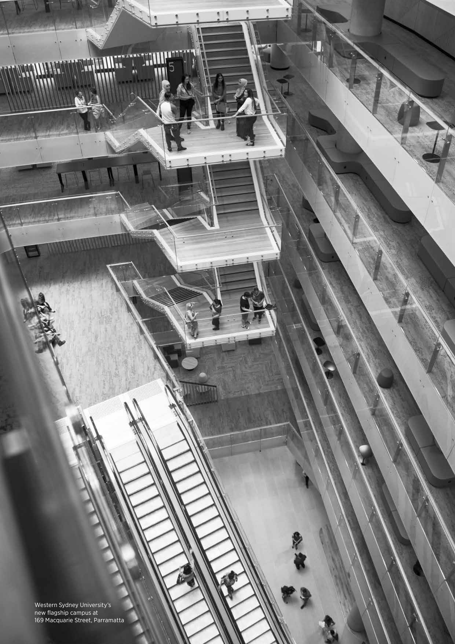
Western Sydney University's new flagship campus at 169 Macquarie Street, Parramatta