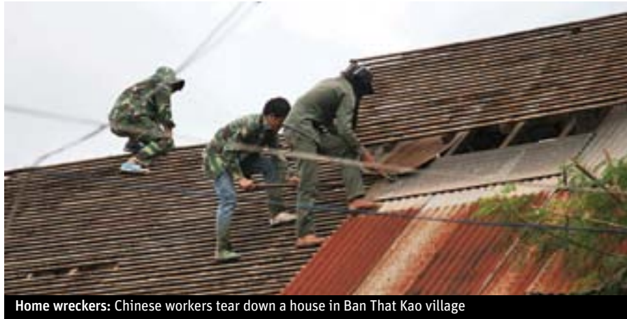
Home wreckers: Chinese workers tear down a house in Ban That Kao village

organisation Helvetas, this reluctance has only intensified.