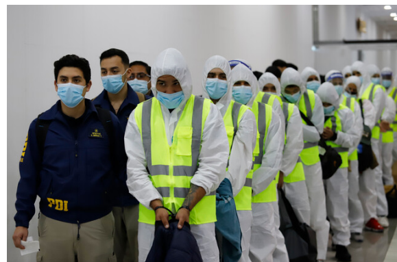
Image: Expulsion of Venezuelan undocumented migrants from the North of Chile in April 2021, the first of 15 flights. 10

The government’s health department had moved groups camping in Colchane into state-run facilities to undergo a 14-day quarantine, however, “undocumented migrants, have been told they must report themselves for ‘illegal entry’, which can be used by courts to justify expulsion orders and reject requests for asylum.” The government is using COVID-19 public health measures to contain people and then to expel them (McGowan, 2021).