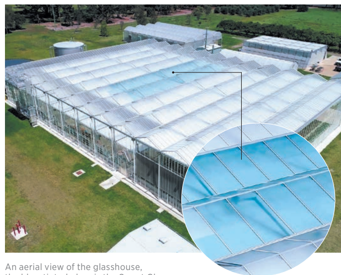
An aerial view of the glasshouse, the blue-tinted glass is the Smart Glass.

"Through the substantial support of HIA and, soon, the Future Food Systems CRC, we have been able to address many of our main objectives by involving technicians, PhD students, and post-doctoral researchers in the research, and developing new technical solutions to maximise food production while minimising resource use and costs," says Tissue. "We plan to expand on our significant progress on the smart glass project through Western's role in the CRC, where we can further modify the technology to provide even greater benefit to crop production by leveraging greater technical capacity including robotics and hyperspectral cameras." ■