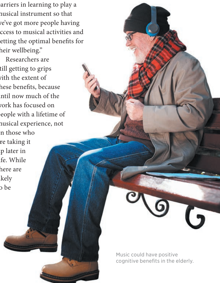
Music could have positive cognitive benefits in the elderly.