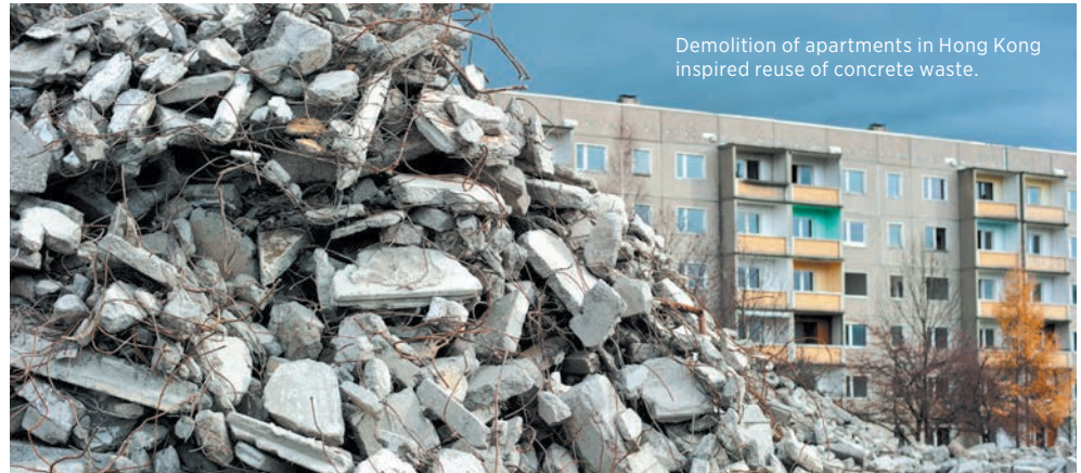
Demolition of apartments in Hong Kong inspired reuse of concrete waste.

Recycling construction and demolition waste to reduce the amount going to landfill.