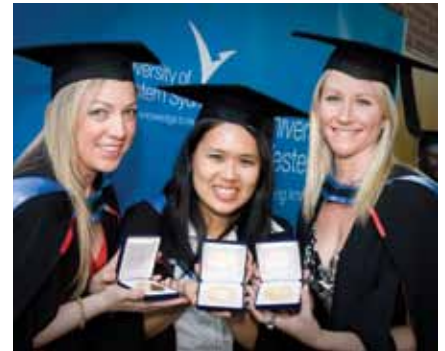
Some of our newest Alumni (above and below) on Graduation Day in September.

For more information on the latest round of ceremonies, or the upcoming Autumn 2011 ceremonies, please visit the New Alumni website at www.uws.edu.au/NewAlumni