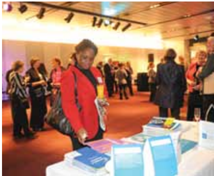
Delegates networking at the Mental Wellbeing Conference