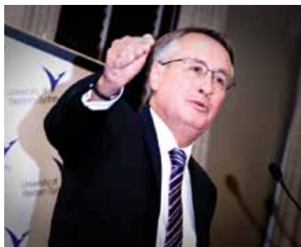
The Honourable Wayne Swan MP