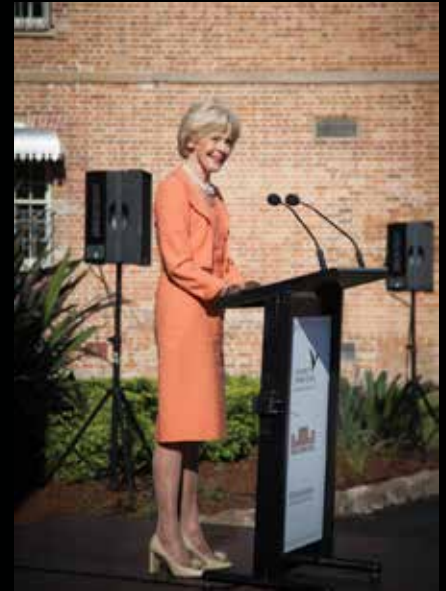
The Female Orphan School Opening, 24 September 2013