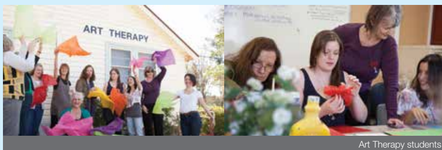
Art Therapy students

Over the course of 20 years, more than 244 students have graduated from the Art Therapy program, and many gathered at the event.