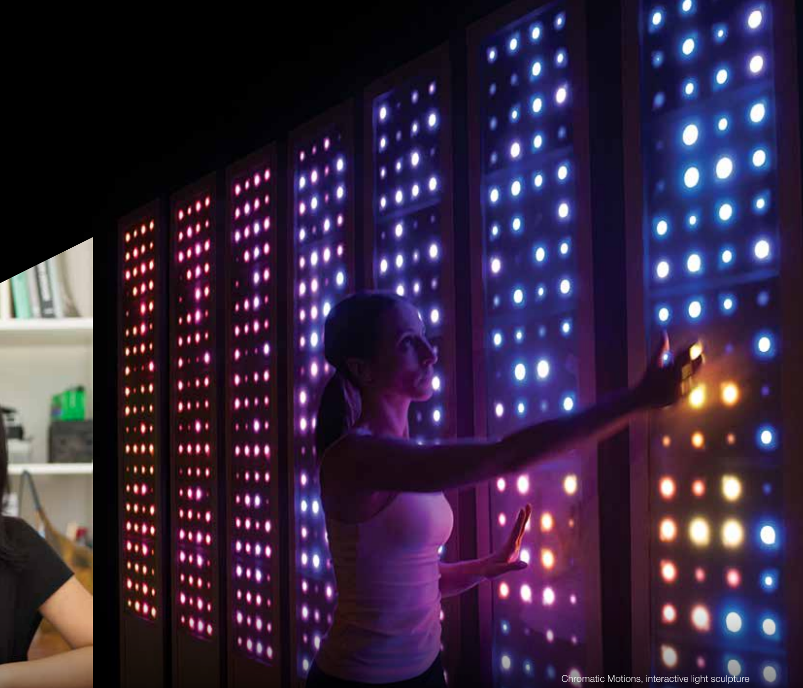
Chromatic Motions, interactive light sculpture

in 2012, and spent a few short stints working for leading design studios such as Frost* before going out on her own. Her portfolio of work is multidisciplinary, ranging from the more traditional visual communication materials such as packaging, branding and identity, to environmental and interactive design.