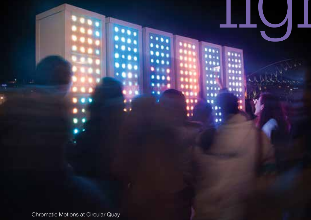
Chromatic Motions at Circular Quay