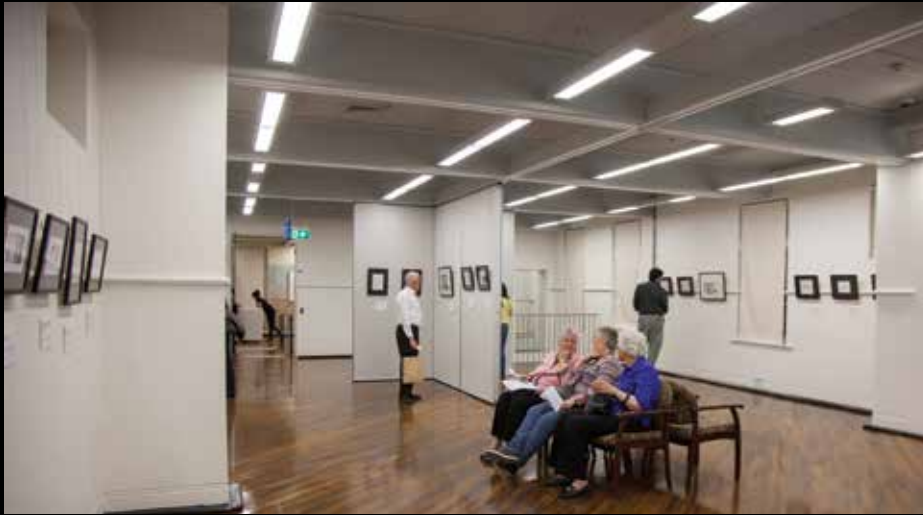
Left: Larger than Life: Gough Whitlam in Cartoons exhibition at the Female Orphan School