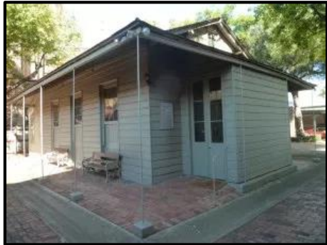
Portable Colonial Cottages (1840)