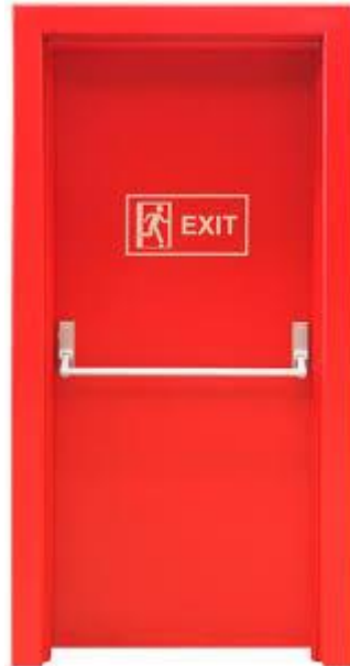
Prefab Continued at Component level