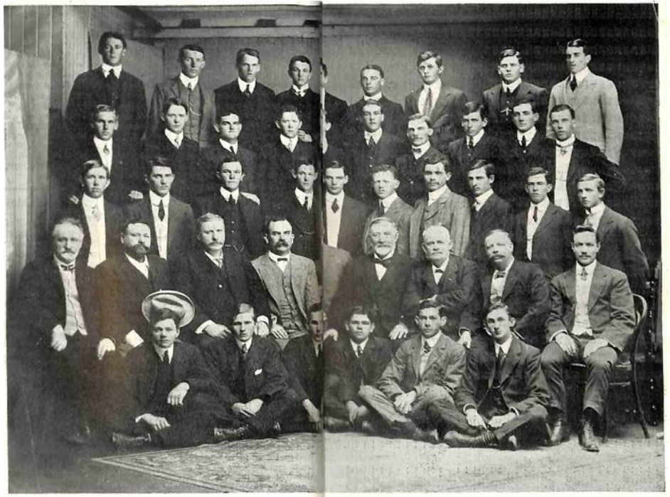
The Senior Class on their trip to the Sydney Factories, When they were the guests of Members of the Council of the New South Wales Chamber of Manufactures