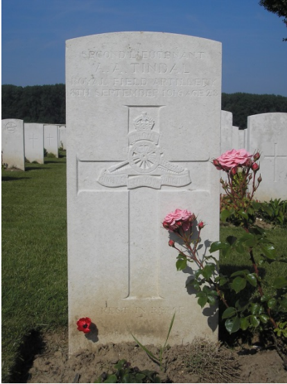
Guillemont Road Cemetery 22 June 2014