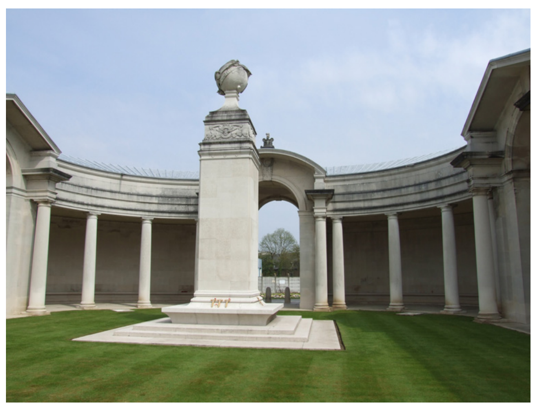
Arras Flying Services Memorial CWGC image

https://www.cwgc.org/find-a-cemetery/cemetery/99996/arras-flying-services-memorial/