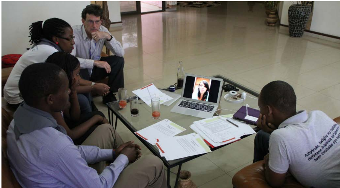
Focus group interviews in Kigali, Rwanda, April 7 2014 (20 years after the start of the Genocide)

the genocide really had occurred. This point needs to be understood in the context that genocide denial (including in Western countries), and the inaction of the international community in 1994, receives a great deal of media attention in Rwanda and features heavily in the education system. Perhaps the most powerful affirmation was that the interviewees recommended that the messages from survivors and supporters should be translated and disseminated to people in other post-conflict societies, and even to current conflict zones such as Syria, to help prevent young people from participating in violence. They volunteered to help form a social network to promote the intercultural activity by working with young Australians and work is currently underway to advance this.