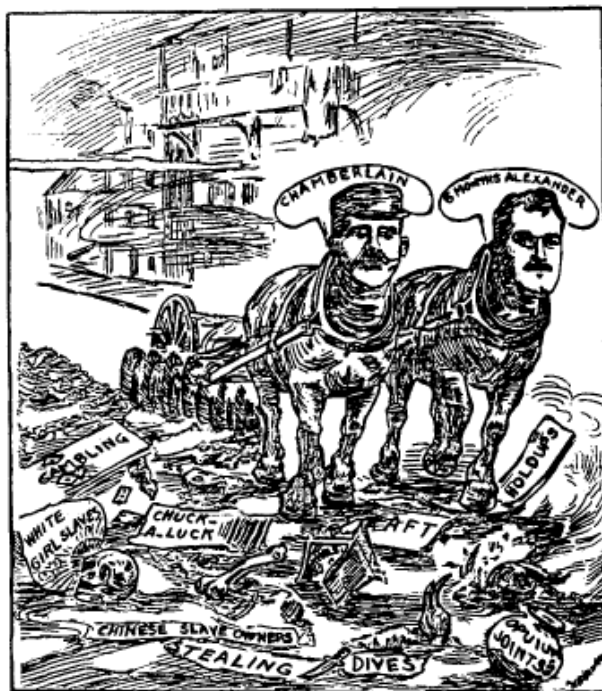
Figure 3: “Vancouver Must Keep This Team”, 1908

Two city hardliners, Police Magistrate Alexander and Chief of Police Chamberlain, legitimized a particular vision of Chinatown in their everyday business (see Fig. 3). As the home of the “racial other,” 12 Chinatown signified many impulses that Europeans feared and attempted to repress in themselves. Indeed as the cartoon suggests, only those aspects of Chinese living that conformed to the categorization “Chinese” were being filtered by members of the governing body of Vancouver, as they were by European communities throughout North America. 13