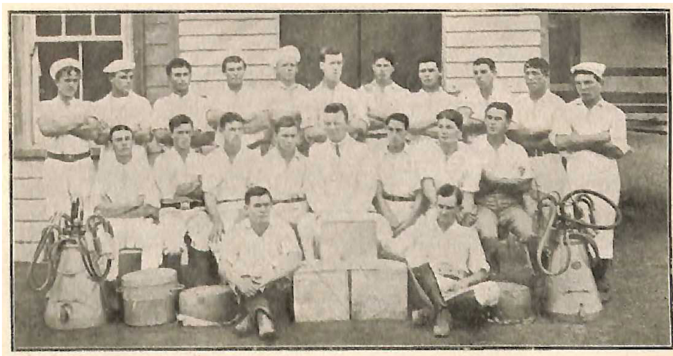
Dairy Class Second Session 1909