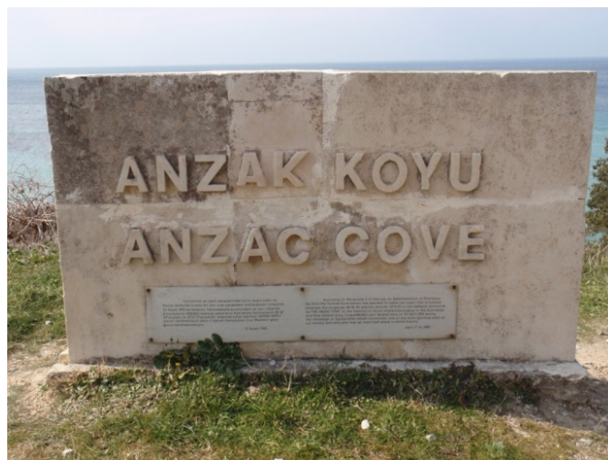
ANZAC Cove Turkey

AI-49219HAC Journal (Vol.VIII, No.1) December 1910 p.179