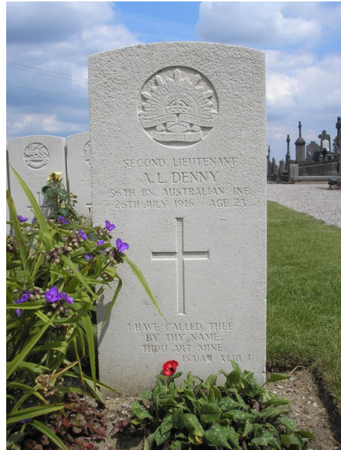
University Archives Ref. AI-46371 Hawkesbury Agricultural College Journal - October 1916 p135