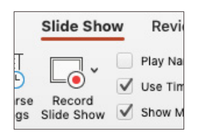
Image 2 - The 'Record Slide Show' button is located under the 'Slide Show' tab.