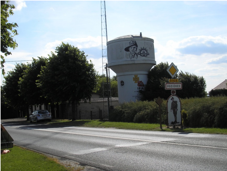
Signage at Pozières 20 June 2014