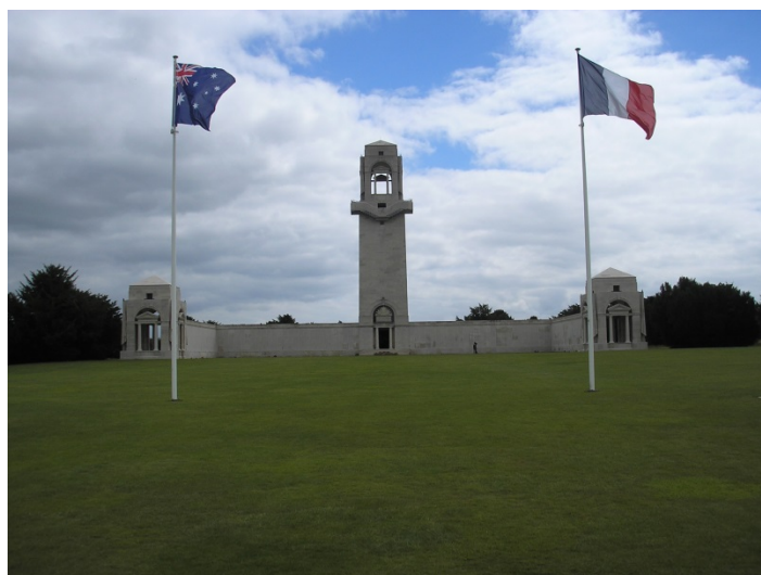
Villers-Bretonneux Memorial, France