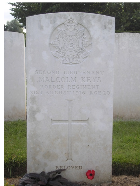
Warloy-Baillon Communal Cemetery Extension