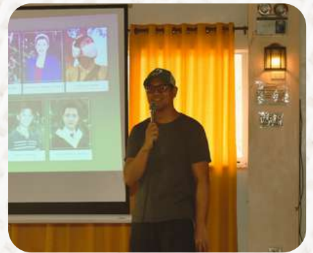
Sir Ferdz of the BEDD