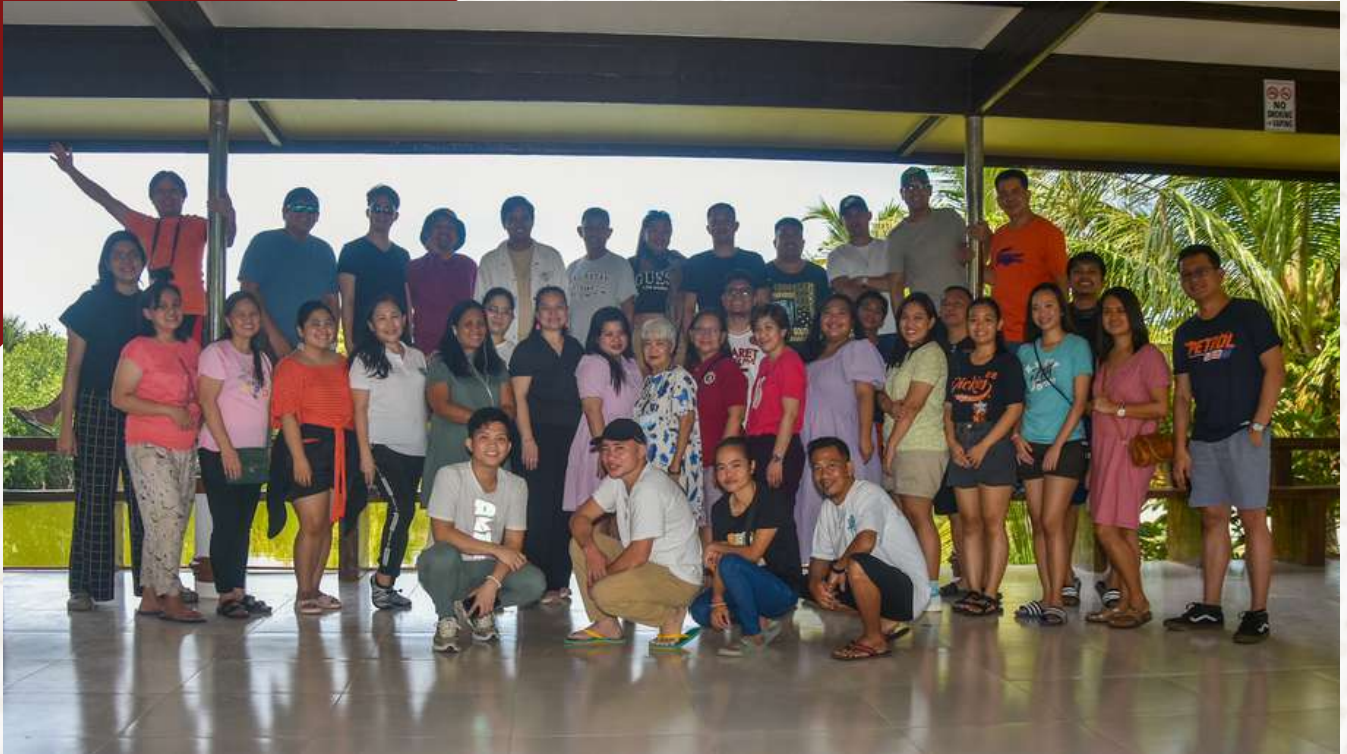
Groufies before leaving the venue