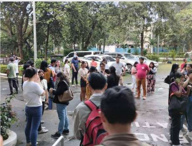
December 5 earthquake