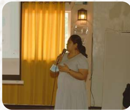
TEED's AA explains about the COPE