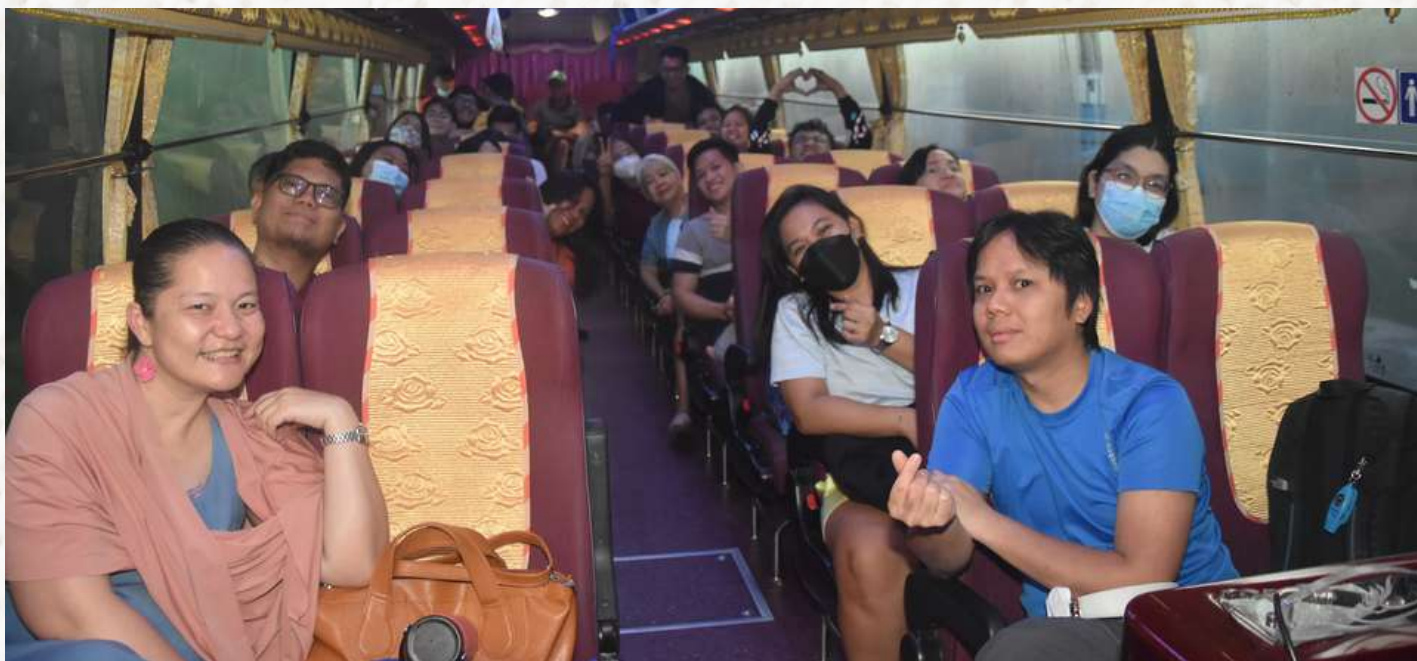
The wISSIh bus (Wish Bus), a videoke session during the trip to Batangas resort.

Savor some pictures of the activities to feel what happened during the two-day activities.