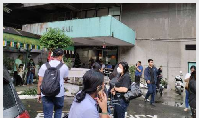
December 5 earthquake