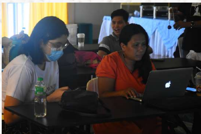
RD staff doing some final touches on their report