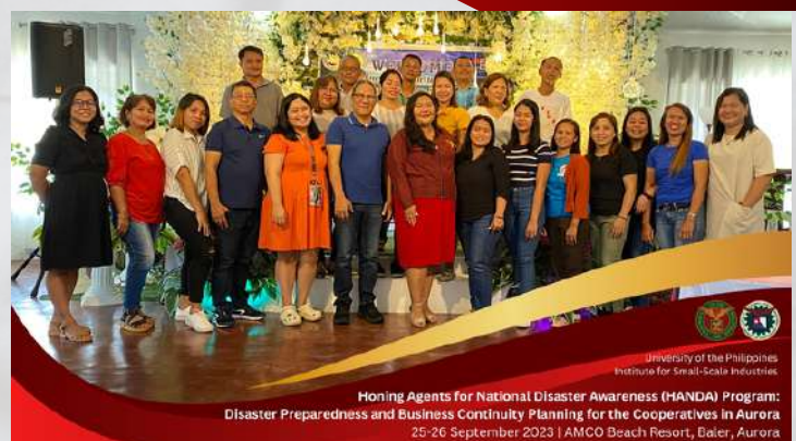
Honing Agents for National Disaster Awareness (HANDA) Program: Disaster Preparedness and Business Continuity Planning for the Cooperatives in Aurora 25-26 September 2023 | AMCO Beach Resort, Daler, Aurora