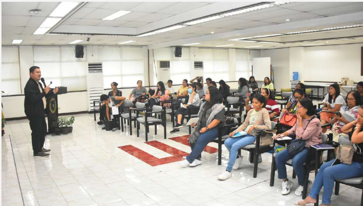
Tara Na Lecture

The University of the Philippines Institute for Small-Scale Industries (UP ISSI) recently commemorated its anniversary with a profound celebration titled "Pagsulong at Pasasalamat: Commemorating Philippine MSME Development through the Years." The event, spanning three days, was vibrant with insights, workshops, and interactions, encapsulating the journey and dedication towards fostering Micro, Small, and Medium Enterprises (MSMEs) in the Philippines.