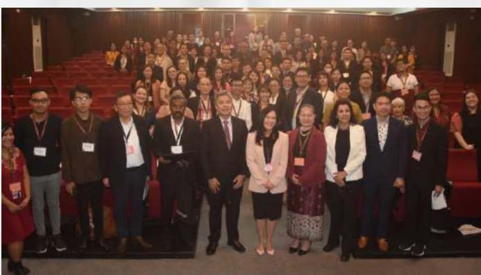
Plenary participants and speakers

Academics, researchers, scholars, and postgraduate students presented their research and diverse insights across various themes covered during the conference. From entrepreneurial behavior and technology adoption to addressing challenges posed by the pandemic, the wealth of discussions promised to shape the future landscape of entrepreneurship and SMEs.