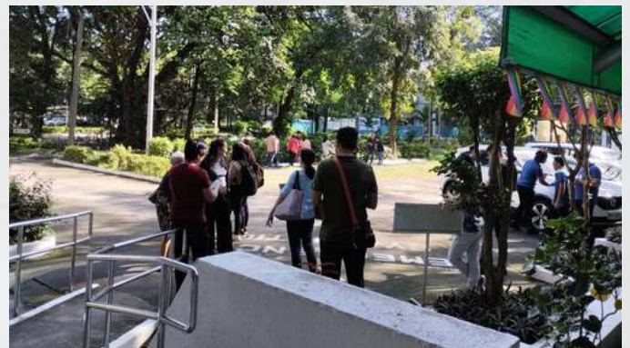
October 13 earthquake