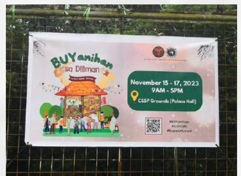
BUYANIHAN PART 3

UP ISSI Celebrates Anniversary with bazaar, learning, mentoring sessions