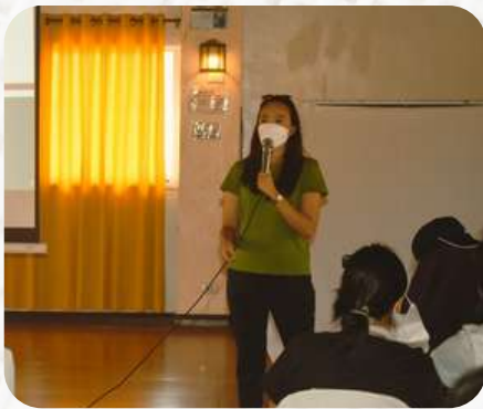
ADD's Menchie reporting