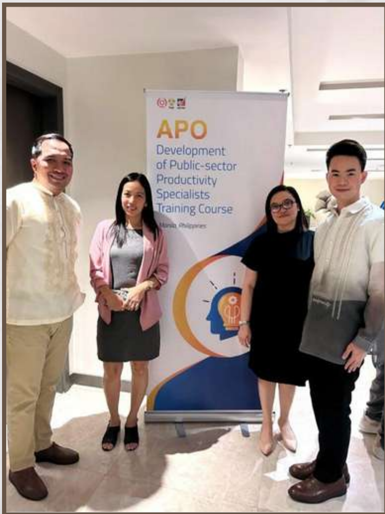
4 Filipino delegates to the APO Training on the Development of Public-sector Productivity Specialist

PASAY CITY – To equip skill sets and competencies for public-sector productivity specialists, four government employees represented the Philippines in the Asian Productivity Organization training on the Development of Public-sector Productivity Specialists on November 06 – 17, 2023.