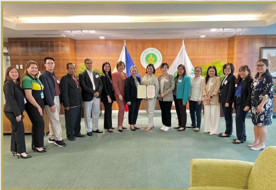
Site visit in the main office of LandBank of the Philippines for the Change Management team

The participants also conducted site visits in the LandBank of the Philippines – Main Office, Quezon City Government and Philippine Statistics Office (Region 3) to prepare their group reports and recommendations as application of their lessons in the course.