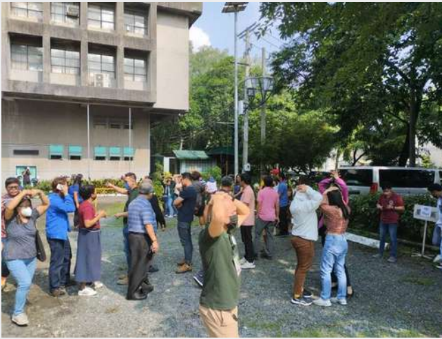
June 8 earthquake drill

The Institute regularly conducted an earthquake drill to be always ready in case the dreaded Big One happens.