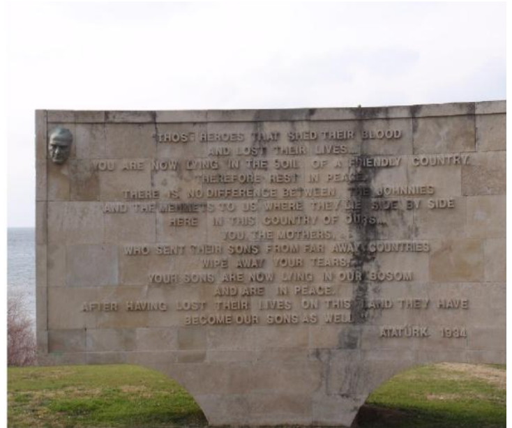
The Atatürk Memorial at Ari Burnu on the Gallipoli Peninsula, Turkey