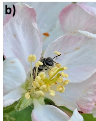
Figure 1: a) Native stingless bee, Tetragonula carbonaria foraging on native Macadamia, b) Native halictine sweat bee (genus Lasioglossum ) foraging on apple.

Australians currently depend heavily on the pollination services provided by introduced European honey bees for food production. Yet, we are relatively ignorant of the pollination potential that native bee species and other insects are contributing to the Australian food basket (Fig 1 & 2a).