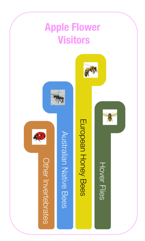
Figure 3 : Pie charts indicate proportions of common visitors to apple flowers in NSW fruit growing regions that are rich or poor in surrounding natural resources, surveyed over a three-year period. Blue Mountains orchards are surrounded by World Heritage sandstone sclerophyll forests - rich in natural resources. In contrast, the upland eucalypt forests of the Central West were cleared for agricultural land use in the previous century and are therefore comparatively poor in natural resources - representative of Australian agricultural landscapes more broadly.