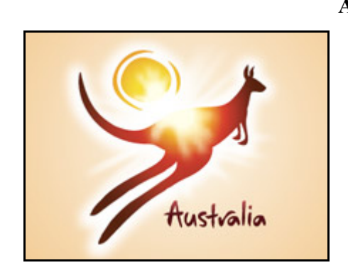
Reprinted by permission from Tourism Australia (2012).

Before this new comprehensive branding program, Australia had successful and failed experiences with tourist branding policies, as is the case with many other countries. Although some initiatives are remembered as disastrous ideas (for example, 'Buy Australian Made'), others were considered effective (the 1986–1998 'Advance Australia' program, for example) (Asociación de Directivos de Comunicación et al., 2003: 93–94). The campaign 'A Different Light' was considered successful, and used several alternative tools to address dissimilar audiences (Avellaneda and Sicari, 2009: 43). In any case, the tourist antecedent reflected and promoted a solid perceived country image primarily based on portrayals of natural landscapes and iconic buildings. Australian commercial and export production (goods and services) has not been internationally noticed nor advertised, and this point will be developed further (Anholt, 2005a: 5).